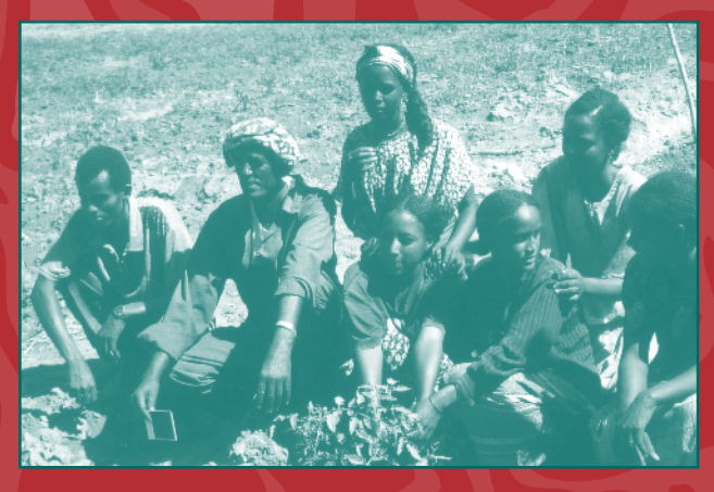
Eritrea Cooperative Development Training Materials